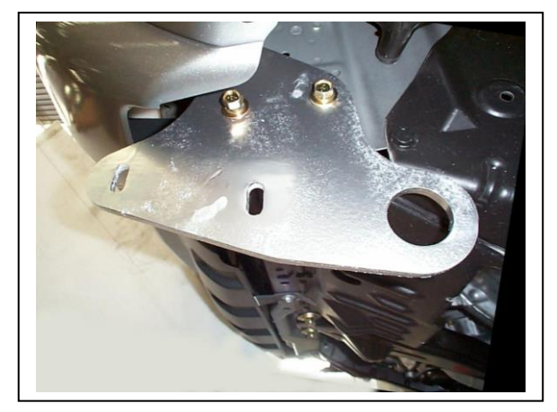
Figure 2 – Passenger side shown