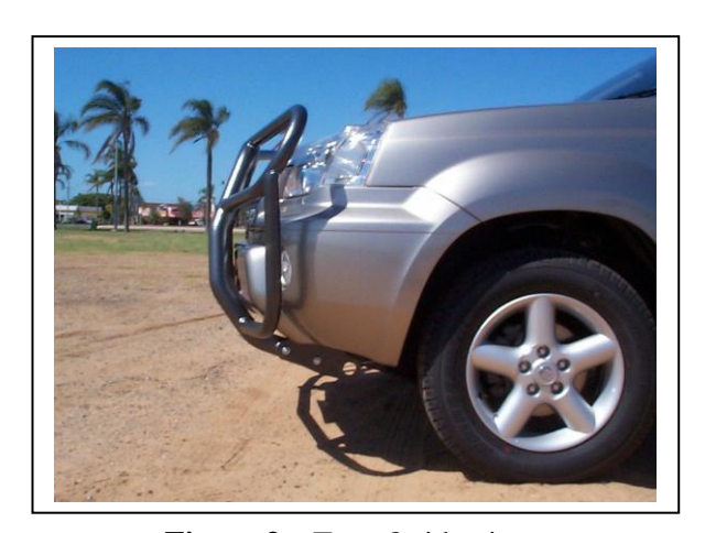
Figure 3 – Type 8 side view