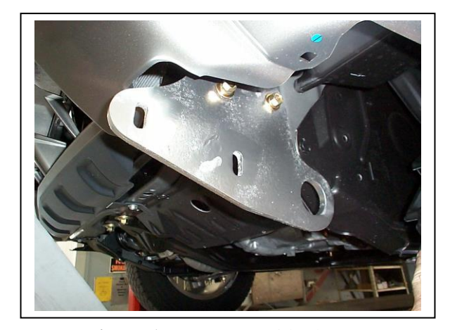
Figure 1 – Passenger side shown